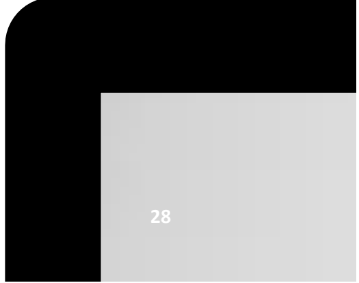
Figure (2): illustrate the mean values of bleeding index (BI) in both sites treated by SRP/CoQ10 and SRP only.