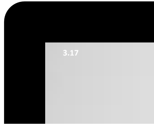
Figure (3): illustrate the mean values of plaque index (PD) in both sites treated by SRP/CoQ10 and SRP only.