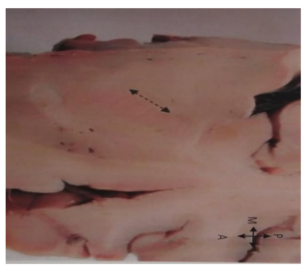
Figure 3: Transverse section 4mm ventral to plane of Mid commissural point showing length of the subthalamic nucleus

nucleus (Figure 2,3) was measured with aid of digital Vernier caliper and magnifying glass.