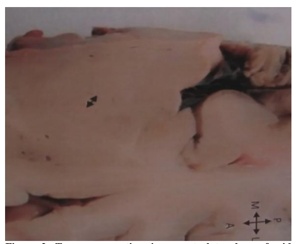
Figure 2: Transverse section 4mm ventral to plane of midcommissural point showing width of the subthalamic nucleus

Transverse section of the brain was made at a plane 4mm ventral to the plane containing mid commissural point. <sup>[5]</sup> The brain specimens were categorized into 3 age groups, Group A: 20-35 years, Group B: 35-50 years and Group C: above 50 years. The dimensions of the subthalamic nucleus were measured bilaterally. The maximum dimension along the longitudinal and transverse axis of the biconvex subthalamic