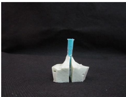
Fig. 3 boxing of impression