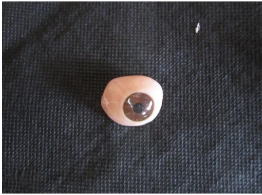
Fig. 7 finished prosthesis