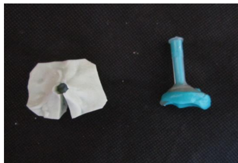
Fig. 4 boxed mould and impression