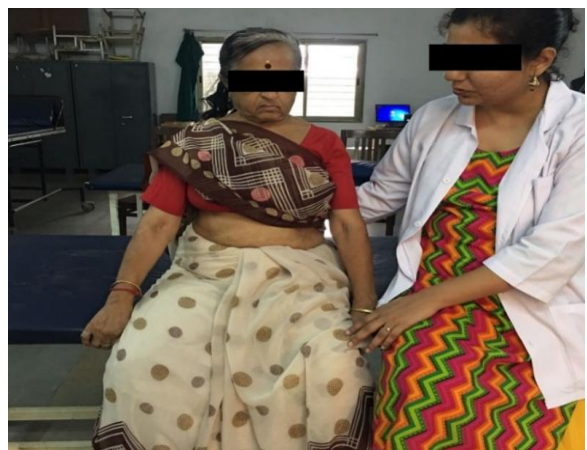
Figure 5: Progression in sitting

The isometric exercises for hip adductor muscles were given in crook lying. Subjects were asked to press pillow between the two knees. It is believed that isometric hip adductors irradiate the contraction to pelvic floor muscles and pelvic floor