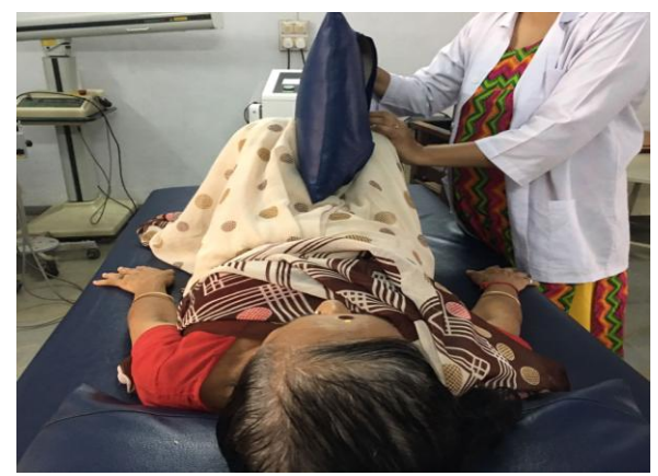
Figure 4: Hip adductor isometric and pelvic floor muscle contraction

abdominis muscle contraction with PFM contraction is now incorporated into treatment protocols. [13] For this reason, transverses abdominis contraction exercise was added with PFM exercise.