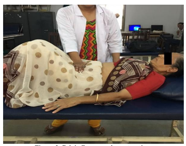
Figure 2: Pelvic floor muscle contraction

The pelvic floor muscle contractions were first taught in crook lying position. On the very first day, the physiotherapist exposed the part and checked for proper contraction. The patients were explained well how to contract the pelvic floor muscles. Once mastered, subject was asked to practice this in sitting position.