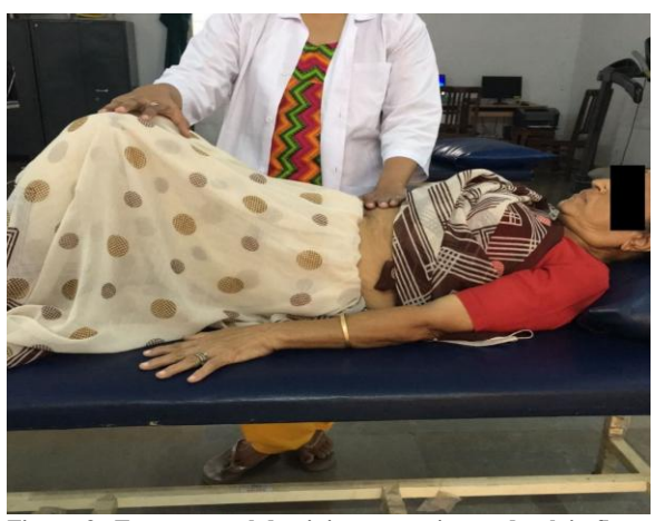
Figure 3: Transverse abdominis contraction and pelvic floor muscle contraction simultaneously

The pelvic floor muscle contraction along with transverse abdominis contraction was performed first in lying and then in sitting. It is believed that there is co-contraction of transverses abdominis muscle during PFM contraction. [12] So, transverses