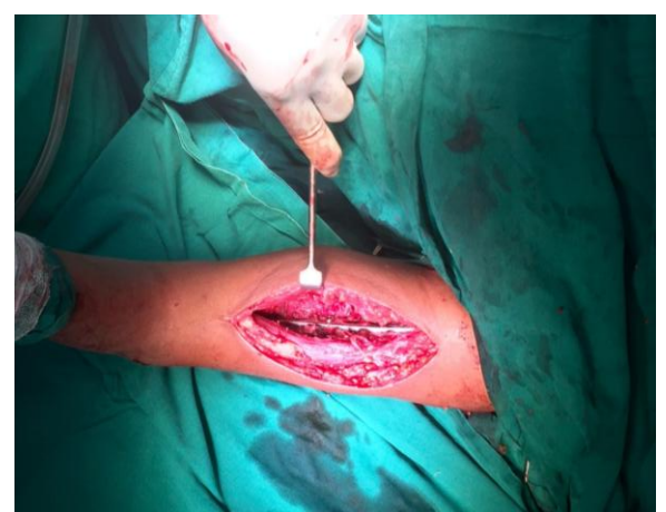
Fig 2.Intra operative position of plate on anteromedial surface of humerus.