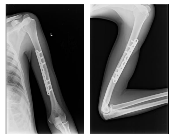
Fig 4a and 4b: Anteroposterior and Lateral x ray showing Plate position on anteromedial surface of humerus.

duration of surgery for The mean anterolateral humerus plating was 74.2± 9.31 minutes, and that for anteromedial humerus plating was 55.5\pm 5.00 minutes. Difference in its duration required for anterolateral and anteromedial humerus plating determined by applying \chi^2 test for independent samples was statistically significant ( \chi^2 =53.611; p <0.001). Difference in the time of union of fracture for anteromedial and anterolateral plating determined by applying \chi^2 test for independent variables, shows ( \chi^2 = 0 ; p=1) which was not statistically significant. (Table: 2)