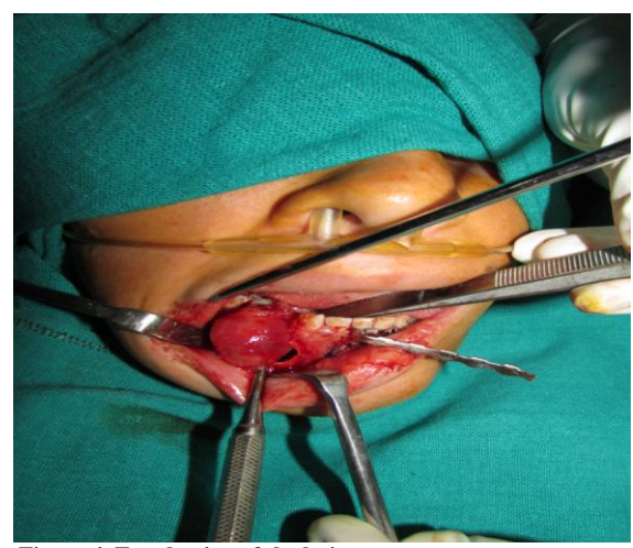
Figure 4. Enucleation of the lesion