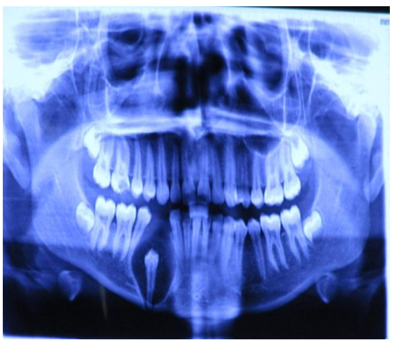
Figure 2. Orthopantomogram shows well defined circumscribed, unilocular expansile lesion