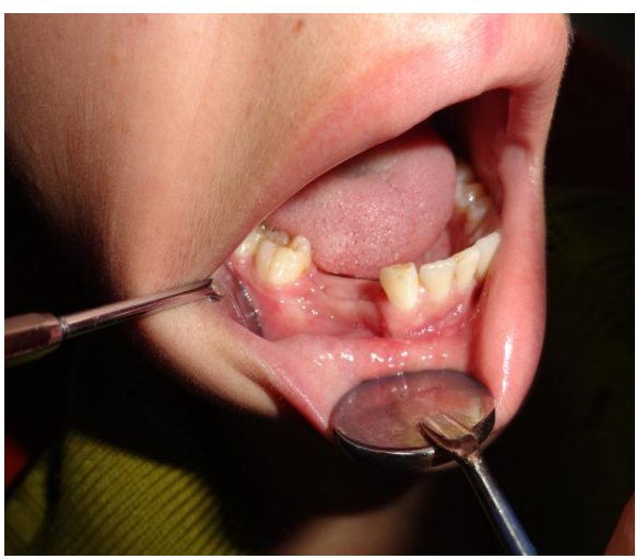
Figure 7. Healed lesion after 3 weeks