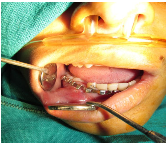
Figure {\bf 1} . Intraoral view shows there is uniform swelling with inflammation of the buccal mucosa