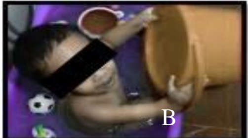
Figure 1 (A & B):