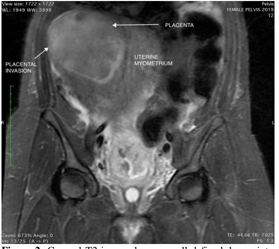
Figure 2- Coronal T2 image shows a well-defined, hyper intense lesion the fundal and right lateral region of uterus communicating with the endometrial cavity. There is loss of normal myometrial signal at fundus and along the right lateral wall between placenta and myometrium with focal bulge which suggests placental invasion.

Uterine bulge/ placental lump and thinning of myometrium were seen in maximum patients i.e. 10 out of 11 patients followed by Myometrial disruption seen in 9 out of 11 patients (Figure 2).