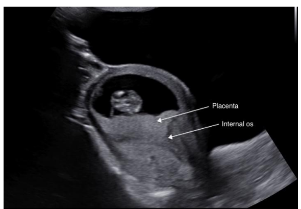
Figure 1- USG shows Grade IV Placenta Previa. Placenta is completely covering the internal os.

All patients showed bulky uterus. Grade IV placenta previa was seen in five patients, out of which two were suspected of having placenta Accreta, two having Placenta Percreta with probable bladder invasion and one with placenta Increta (Figure 1).