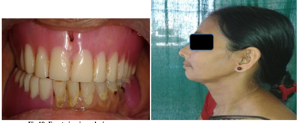
Fig 18: Front view in occlusion Fig 19: lateral view of patient with established vertical dimension after wearing denture