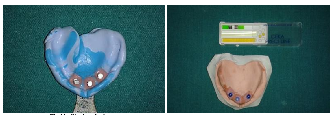
Fig 11: Gingimask placement Fig 12: Plastic bar pattern with screw ( Ceka Preci-line) was used