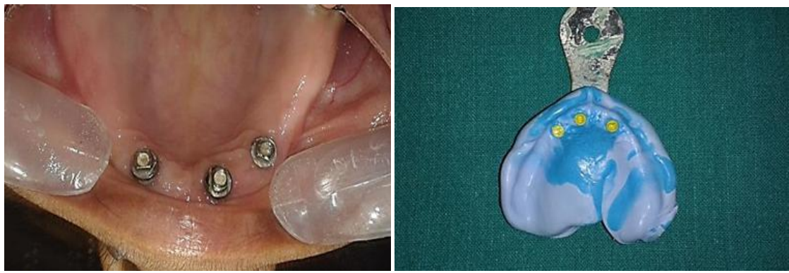
Fig 9: Healing phase 6 weeks after surgical phase Fig 10: Impression taken by double mix single impression technique