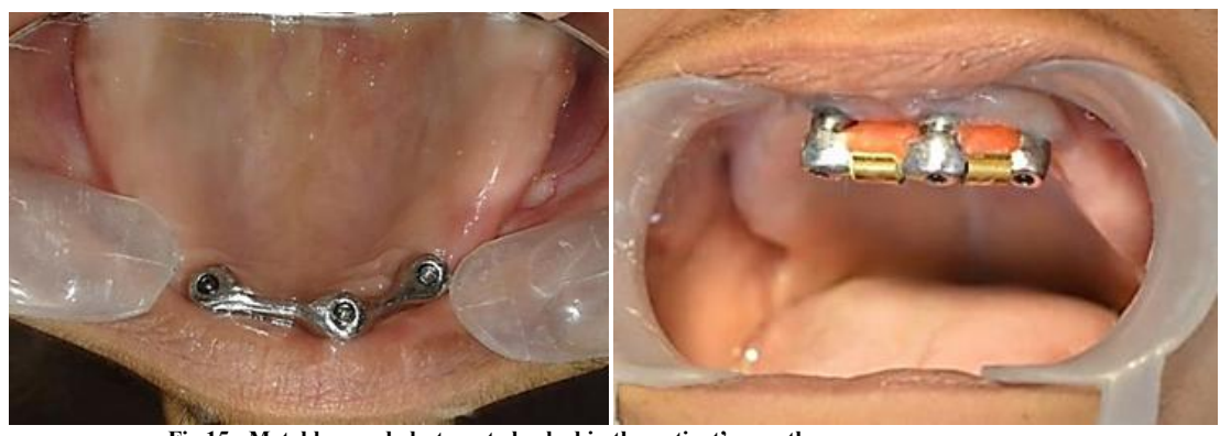
Fig 15: Metal bar and abutment cheeked in the patient's mouth Fig 16: Yellow rider and SS housing placed on the metal bar and Undercut block by wax