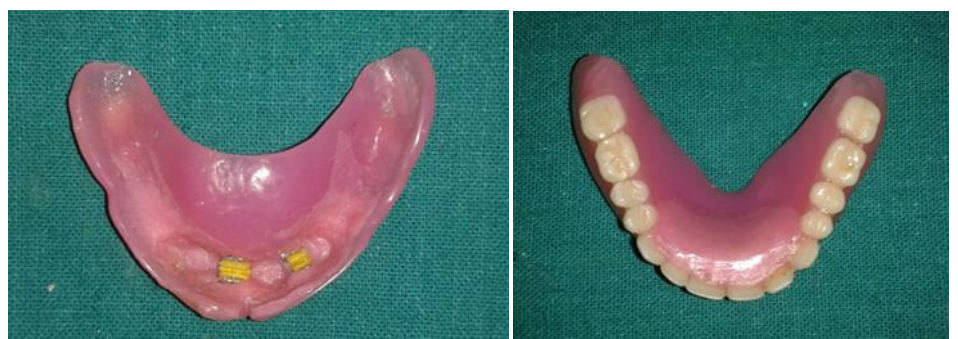
Fig 17: Intaglio and cameo surface with clip and metal housing of over denture