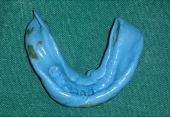
Fig 4: Final impression of lower arch