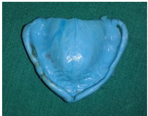
Fig 3: Final impression of upper arch