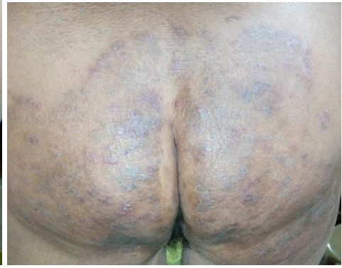
Second follow up-08.11.17