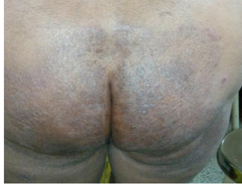
Third follow up- 22.11.17