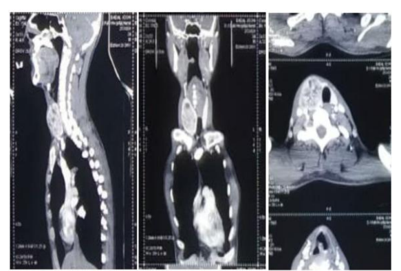
CT SCAN FINDINGS SHOWING THYROID LUMP

Running in congruence with the USG report the CT was also suggestive of a welldefined heterogeneously hypodense lesion with few non-enhancing areas and few foci of calcification within. Medially the lesion was causing mass effect in the form of compression and displacement of trachea contralaterally with mild luminal compromise. Laterally, it was also seen displacing the right carotid vessels posterolaterally without any thrombosis or narrowing. FNAC correlation was demanded for on CT scan. On an USG guided FNAC the features came suggestive of metastasis of epithelial malignancy most probably Adenocarcinoma lung. Patient was started on 50mcg of Tab Levothyroxine for 6 weeks, along with the ongoing treatment for other comorbidities. He was referred out to the department of Medical Oncology for further management of the cancer.