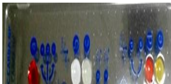
Figure 3: Positive Rapidec Carba NP test showing colour changed from Red in Control well d to Yellow in Reaction well e

The test is based on the principle described by Nordmann, Poirel, Dordet. It detects carbapenem hydrolysis by carbapenemase producing bacteria, resulting in Acid production causing change of colour of Ph Indicator phenol red. Test was done as per manufacturer instruction. 10µl of inoculum equivalent to loop full of colonies taken from culture plate is mixed with cell, visual reading of Test strip was done initially after 30 minutes of incubation at 37°C & later after 2 hours if required, of Control well without Imipenem to Reaction well containing Imipenem as Carbapenemase substrate Zinc for MBL producing gram negative bacilli. Test was interpreted as positive if colour changed from Red to Yellow or Red to Orange as shown in Figure 3 & Figure 4 respectively & Negative if no colour change observes From Red in reaction well e when compare to d control well as shown in figure 5 & reference provided in Table 1.