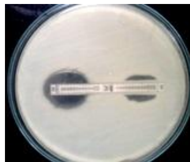
Phenotypic EZYMIC ™ strips for MBL Detection: [19] Figure 1

Prospective, observational, laboratory based study was conducted after obtaining Institutional Ethics Committee clearance. The study was conducted at Microbiology Laboratory of tertiary care centre. Fifty Gram Negative bacilli, isolated from paediatric population, identified as Carbapenemase resistant by Vitek 2 Compact were included in study. MBL production was further confirmed using EZY MIC ™ (EM078) E. strips by HIGH-MEDIA with Imipenem alone & Imipenem with & without EDTA combination & HIGH-MEDIA Imipenem Disc with & without EDTA were used for MBL detection.