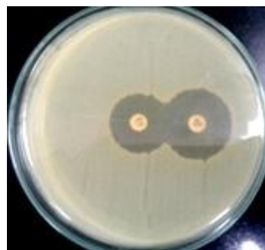
Combined Disk test (Imipenem 10µg + EDTA 750 µg HIGH-MEDIA): Figure 2

Phenotypic MBL detection strip which is coated with mixture of Imipenem + EDTA (1-64 mcg/ml) & Imipenem (4-256mcg/ml) on single strip in a concentration gradient manner were used. The upper half of the strip has Imipenem + EDTA with highest concentration tapering downwards whereas half is similarly coated with Imipenem in a concentration gradient in a reverse direction.