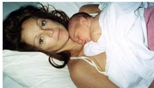
Figure 2: The Kangaroo Position achieves Skin-to-Skin Contact (SSC) (mother’s consent was received.)

care. The evidence shows that SSC in the first two hours after birth programs infant self-regulation that is detectable in 12-month follow-up. (20) SSC is a central feature of and facilitates Step 4 of the WHO-UNICEF Ten Steps to Successful Breastfeeding, (21) part of the Baby-Friendly Hospital Initiative (BFHI)(Table 1).