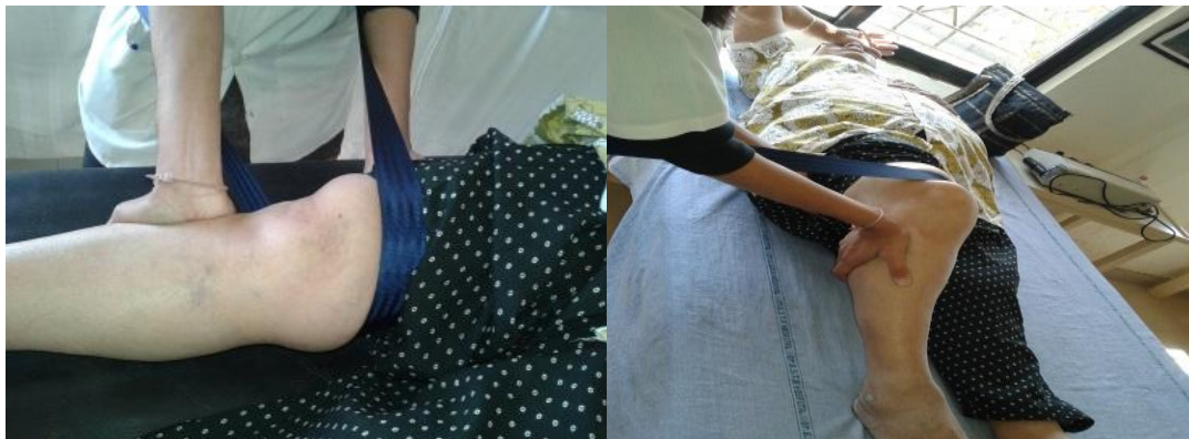
Figure 2: Application of medial glide starting position and movement for knee flexion

Mulligan's MWM: Mobilization technique was selected based upon patient's complaint. There are two techniques which were performed: the first is the medial or lateral glide MWM depending on site of pain (medial glide with medial knee pain and lateral glide with lateral knee pain).