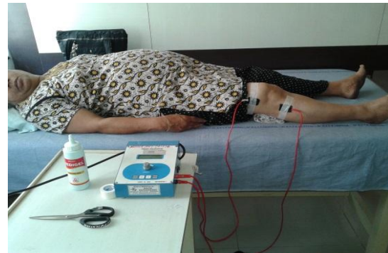
Figure 1: method of application of TENS

TENS: Conventional 2 pole TENS with frequency of 100 Hz was given for 15-20 minutes for 3 days from day 1. (11) Patients were treated in supine position with roll under their affected knee.