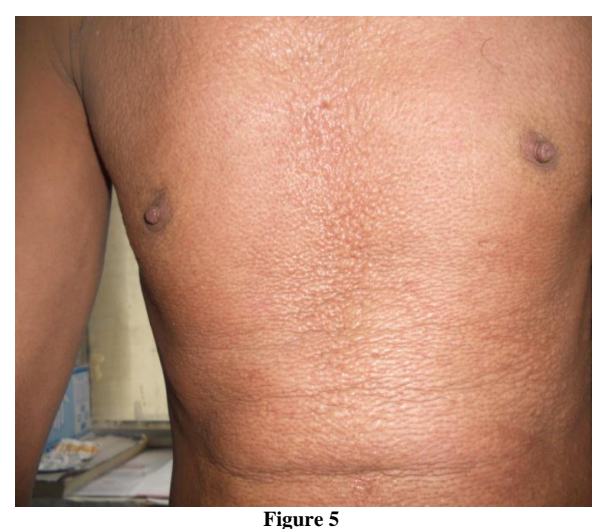
Figure 2, 3, 4, 5. Shows closely spaced, mildly erythematous, waxy, firm, papules over shiny, indurated and non-tender skin over neck, chest, lower abdomen and back.

In our patient use of high dose dexamethasone pulse in our patient was successful in inducing remission and patient remained in well till his last review after 1.5 years, dexamethasone is exceptionally long acting corticosteroid with potent glucocorticoid activity and preferably given in pulse therapy to alleviate risks associated with long term use of corticosteroids. Suppression of immune response and fibroblast proliferation is the mechanism leading to decreased paraprotein synthesis