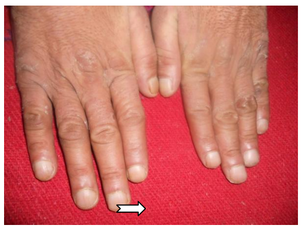
Figure 6. Over the proximal interphalangeal joints a central depression surrounded by elevated rim, "doughtnut sign".

We advocate pulse dexamethasone therapy as first line treatment option supplemented with PUVA therapy in lichen scleromyxoedema, a rare and difficult to treat disease.