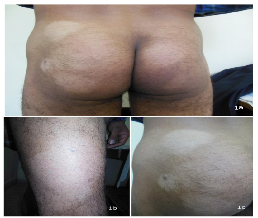
Figure 1: (1a)- Multiple hypopigmented patches over lower back and gluteal region variable in size, (1b)- hypopigmented patch on right thigh, (1c)- hypopigmented patches showing subtle atrophy and minimal induration.

patient was started The on photochemotherapy with Psoralen-UVA (PUVA), with three sessions per week. There was gradual decrease in induration and atrophy, and improvement in the colour of the lesion over next 3 months (Figure 3). The Patient was off PUVA after 6 months of treatment. The follow up till next 18 months treatment didn't show after any clinicopathologic evidence of relapse.