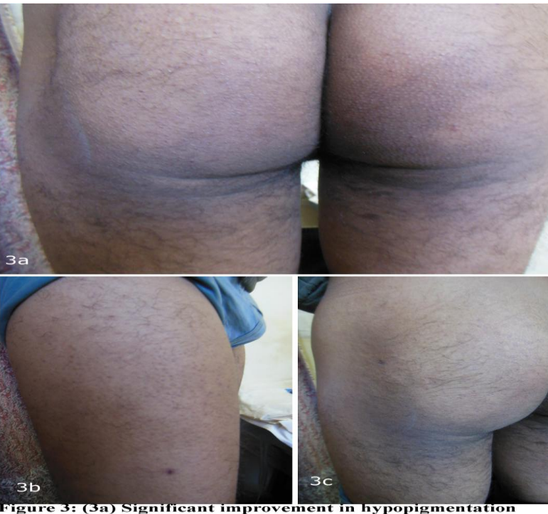
Figure 3: (3a) Significant improvement in hypopigmentation and atrophy over the lesions after 3 months of PUVA therapy, (3b) lesion on the right leg getting skin colored after the treatment, (3c) clearing of the lesions on left gluteal area.