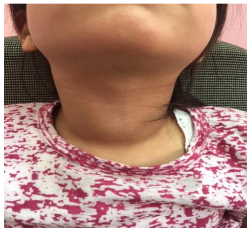
Figure 2: anterior Medline neck swelling (goiter)