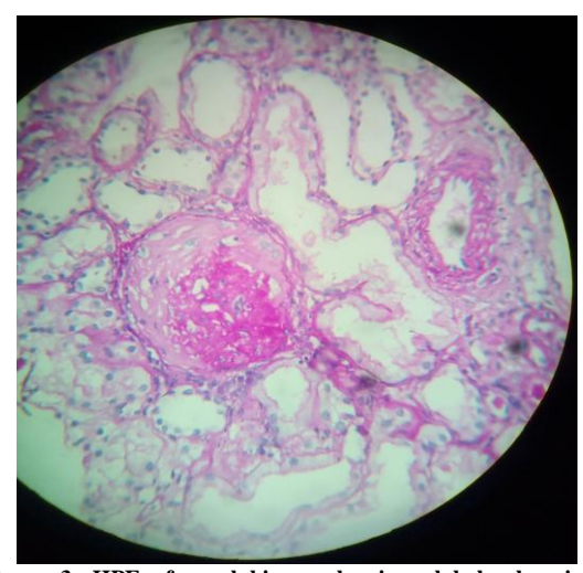
Figure 3: HPE of renal biopsy showing global sclerosis of glomerulus. \,

Patient was treated with hemodialysis along with potassium supplementation, correction of metabolic acidosis and other supportive measures. Following treatment, her muscle power improved and hypokalemia got corrected