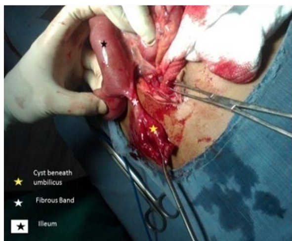
Figure (2): Intraoperative picture showing the fibrous band and cyst.