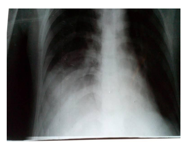
Figure 2: CXR shows opacity in right pleura S/o rupture of liver abscess in pleura.