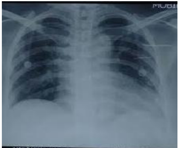
Figure 4: Chest Xray AP view after one week of treatment. Most of the infiltrates have resolved.

Chest Xray: after 5 days of initiating treatment.