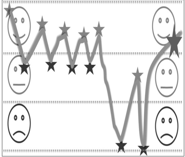
Figure 1: Sample of a River of Life

Each question is fortified with probes necessary and channelizing questions. The sixty minute session is divided into five un-equal sections of time giving more importance (time) to the present and the future. The therapist takes a supportive stance when talking about the negative experiences and facilitates ventilation. While talking about the positive experiences, the therapist gathers a more encouraging stance and facilitates enthusiasm.