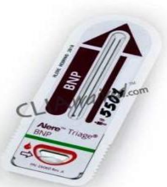
Figure 1: BNP Tester

Heart Failure: Assay of BNP is a potential aid in the diagnosis of heart failure. BNP testing allows a rapid assessment for defining those patients warranting an echocardiogram and also has a potential to enable rapid changes in therapy for those already receiving treatment for heart failure. BNP testing is effective in screening for left ventricular systolic dysfunction and reduces the number of patients requiring an echocardiogram. [5,6]