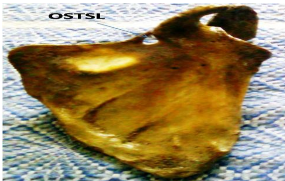
FIG: 02: Shows Right side (OSTSL) Ossified Superior Transverse Scapular ligament