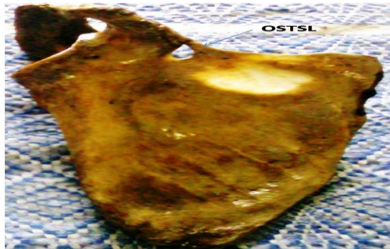
FIG: 01: Shows Right side (OSTSL) Ossified Superior Transverse Scapular ligament.

completely in 3 Scapulas among 200 specimens. 2 scapula right side (FIG: 01, 02) and 1 scapula left side (FIG: 03) showed complete ossification. Study shows the prevalence of ossified superior transverse scapular ligaments is 1.5% in south Indian population.