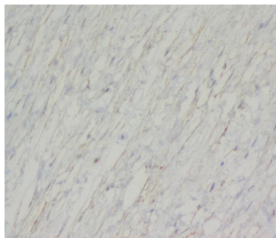
Fig 3- Focal positivity in tumor cells EMA, X2

The etiology of perineuriomas is not yet established. Possibility of being a reactive