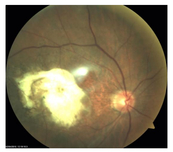
Fig.1: Large Fibrous macular scar right eye.

both eyes, which persisted and gradually worsened in the weeks following exposure. On taking detailed history we found that his visual complaints had stabilized for the last 2 months and at no time he had complaints of pain or symptoms of ocular surface inflammation. On taking history of drug treatment, the patient gave history of anxiety neurosis for which he was being treated with benzodiazepine, oral alprazolam 0.5mg every night with occasional tab diazepam1 mg during acute attacks for the last eight years, apart from which there was no significant medical or drug history.