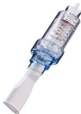
Figure 1. Threshold PEP®, Respirationics; Cedar Grove, NJ, USA

The patient No. 1 received verbal and written instructions (Table 2) to contact a cardiologist or a physiotherapist in case of a problem with training. The physiotherapist called the patient weekly for 10 weeks to check that the device was working and to ask about the patient's condition. At the end of the training period, the physical examination and pulmonary function tests were repeated.