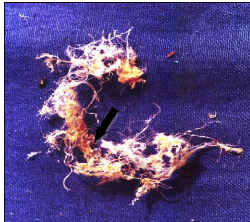
Figure – 1: Corrosion casting showing the cortical network of renal vasculature

comprised equally of both sexes, the age group ranging from 20-60 years were utilized to study the renal vasculature from their origin to termination and its morphometry by corrosion casting method. We observed the branching pattern of the main trunk of renal artery from its origin to its termination along with cortical network of anastomoses (Figure-1).