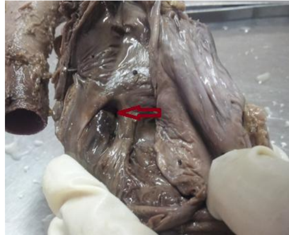
Figure 2: Patent foramen ovale with 2mm vertical diameter *The arrow showing the patency of foramen ovale