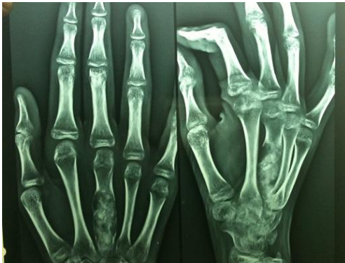
Figure 1 aneurysmal bone cyst of third metacarpal

Operative Procedure: Curettage of cystic lesion done through dorsal longitudinal incision over third metacarpal. Autologous iliac bone graft harvested from right iliac crest ,crushed into small pieces and inserted into bony defect. Hand was immobilized in short arm cast for four weeks. After which physiotherapy started for three weeks,consisting of progressive active and passive exercises.