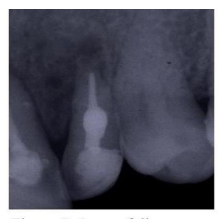
Figure 2: 1-year follow-up radiograph

used to fill the defect 3-dimensionally. The flowable gutta percha was compacted into the canal with endodontic pluggers using light apical pressure (figure 2). The quality of obturation was confirmed radiographically and the access opening was permanently sealed.