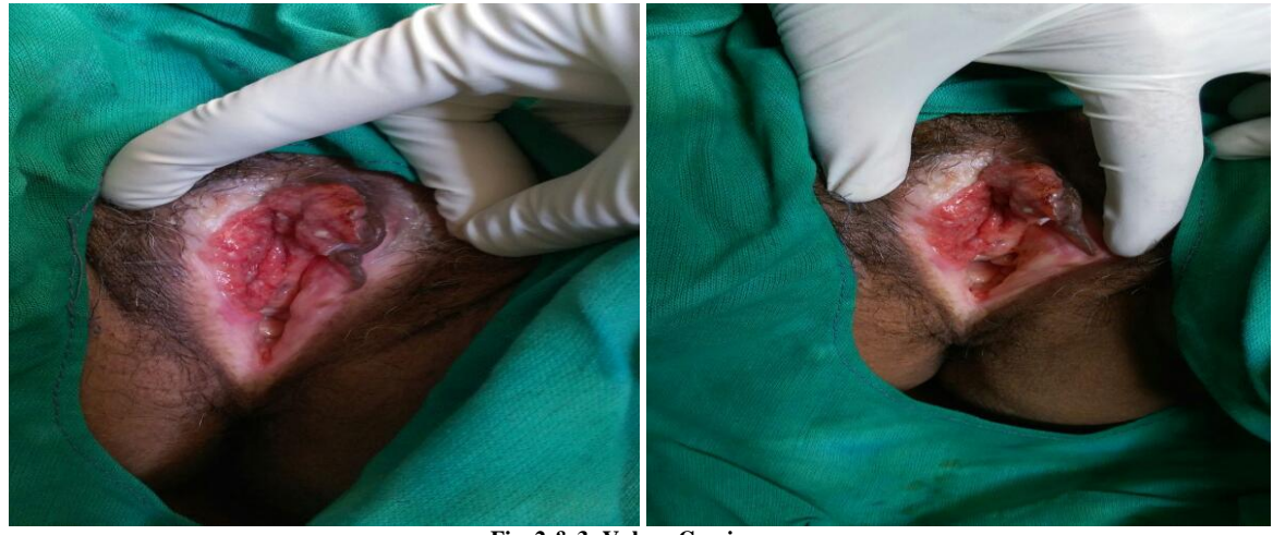
Fig. 2 & 3: Vulvar Carcinoma

vulvar carcinoma, confirming our diagnosis. Inguinal lymphadenopathy and inflammation was probably reactionary to infection superimposed on the carcinomatous growth. Ultrasound of abdomen and pelvis was normal. We, hereby, emphasize the importance of a careful examination of the vulva in very gynecologic examination.