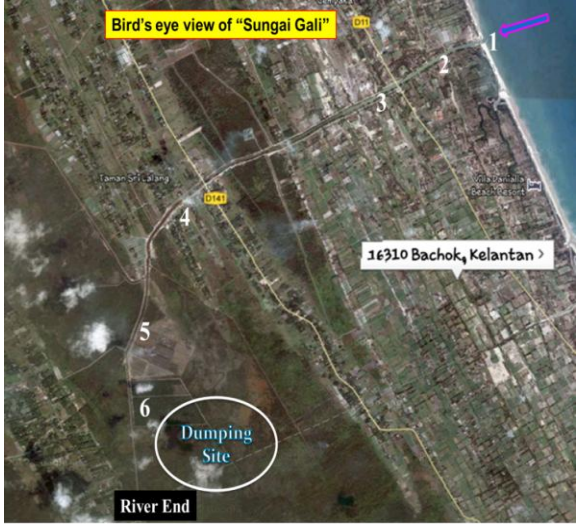
Figure 1: Bird's eye view of Gali River (Sungai Gali) showing the artificial waterway

the sea through the water way. Figure 1 show the bird's eye view of Gali River, garbage dumping site and sampling points (1 to 6). The study was to assess the influence of garbage dumping site located near the Gali River as well as the river water quality. The water quality was assessed by comparing with Water Quality Index norms of Malaysia Environmental Department. The quality of water from different stations was assessed and recorded.