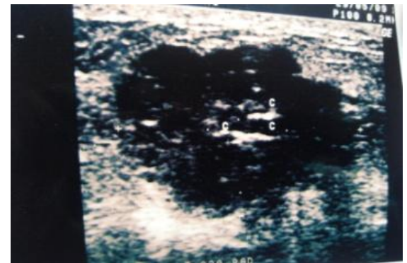
Fig.3: Microcalcifications in malignant mass