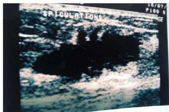
Fig.1: Spiculated hypoechoic mass

Because some ellipsoid or gently lobulated malignant lesions do not have well-circumscribed, thin pseudocapsules and some purely intraductal malignant lesions have thin, echogenic walls, a combination of either an ellipsoid shape with a thin, echogenic pseudocapsule or gentle lobulation with a thin, echogenic pseudocapsule was required for benign classification.