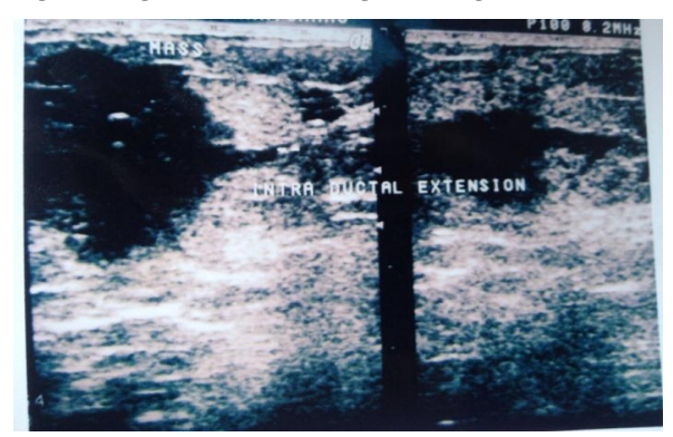
Fig.4: Intrductal extension in malignant mass