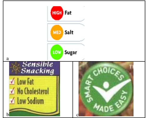
Figure 3 Different logo designs developed for helping

displaying a green check mark, (50) The Sensible Solution from Kraft foods displaying a green flag with yellow sun. (51) All these are front-of-pack labeling schemes aim at facilitating consumers make healthier food choices. About 118 models have been identified so far, of which 63 are meeting the WHO inclusion criteria but only onethird of those have been validated. (5,52) Different models have been conceptualized different purposes which include for labeling requirements, regulatory purposes for products to bear a claim, food certification, T.V advertising/marketing of food products to children and few of them developed for research purpose. Table 1 provides a brief description of few of them.