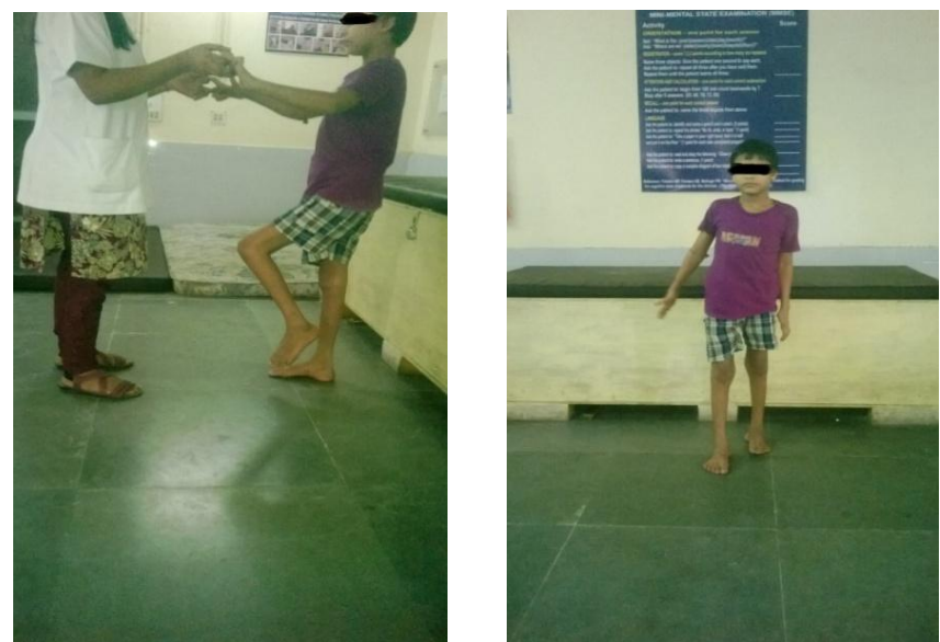
Fig 3:- Weight shifting exercise, single limb loading.

Balance exercise: For improvement of balance, functional exercises like weight shifting exercise, single limb loading (fig.3), tandem stance (fig.4) were done. Ball catching and throwing in diagonal direction with different speed and reaching activities in different direction were performed with patient sitting on a gym ball with both his foot supported on a ground and with patient standing on a floor ,were given (fig.5 & 6). It was done for 60 min. thrice a week.