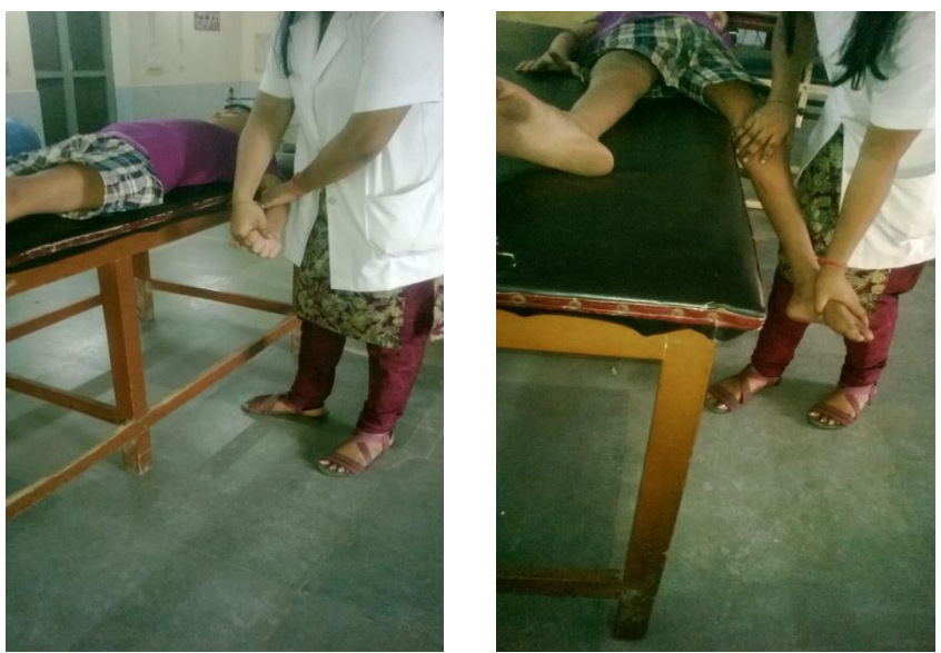
(FIG.1) (FIG.2) Fig. 1 and 2:- PNF pattern for upper and lower limb respectively.

Balance exercise: For improvement of balance, functional exercises like weight shifting exercise, single limb loading (fig.3), tandem stance (fig.4) were done. Ball catching and throwing in diagonal direction with different speed and reaching activities in different direction were performed with patient sitting on a gym ball with both his foot supported on a ground and with patient standing on a floor ,were given (fig.5 & 6). It was done for 60 min. thrice a week.