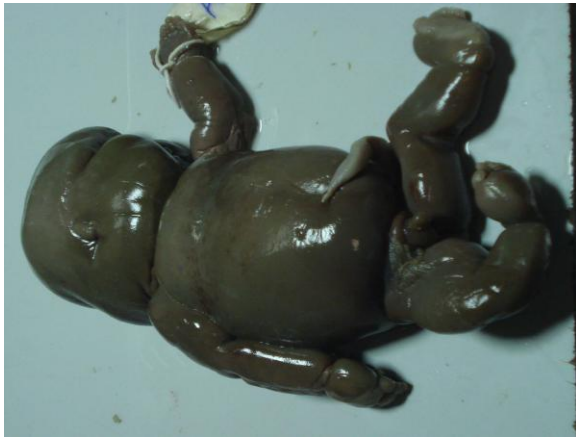
Figure-1: Shows foetus of 20 weeks gestation with edematous skin.

Generalised subcutaneous edema was noted. Foetal heart rate was absent. Foetal parameters were noted and final impression was intrauterine death with hydrops foetalis. Maternal laboratory findings were within normal limits. Her blood group was “O positive” and husband’s blood group was “AB positive”. Antibody screening test was negative. Maternal serum titres for toxoplasmosis, rubella, cytomegalovirus, parvovirus, syphilis were negative. Therapeutic abortion was done and a still born foetus was delivered which was sent to the department of pathology for foetal autopsy.