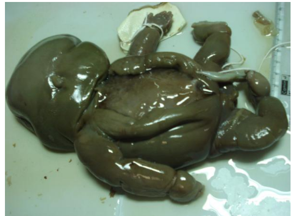
Figure-2: Shows a Y shaped incision with the skin stretched.