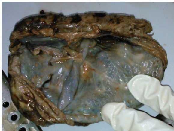
Figure-5: Shows internal surface of placenta.