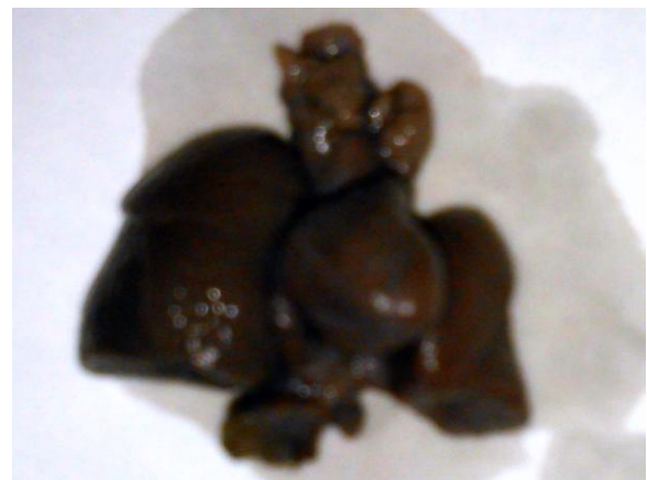
Figure-4: Shows enmass thoracic organs.