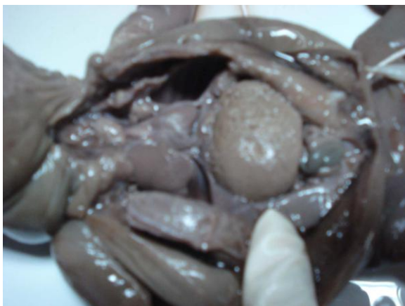
Figure-3: Shows thoracic and abdomen organs.