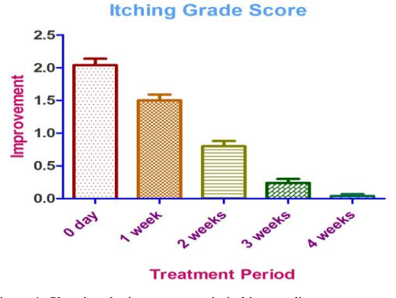
Figure.1. Showing the improvement in itching grading score.

discontinued from the study after one week due to secondary skin infection which required anti biotic treatment. Total number of 50 patients were completed the study successfully.