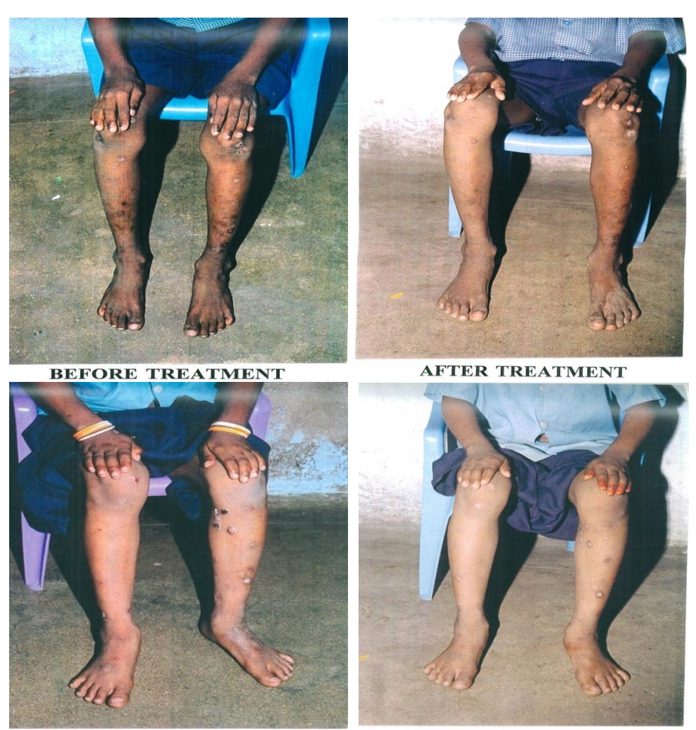
BEFORE TREATMENT Figure.4. Clinical improvement of scabies after Thelkodukku Chooranam treatment.

indicated that the drug Thelkodukku Chooranam possess scabicidal activity.