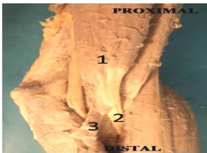
Figure 1: Skin and subcutaneous tissue has been stripped off to show biceps brachii muscle and its distal tendon. 1-Biceps brachii, 2-biceps tendon, 3-lacertus fibrosis.

its insertion site on the radial tuberosity. (5) Contemporary anatomic descriptions of the biceps brachii muscle offer only a generalized description of the distal biceps brachii tendon, bicipital aponeurosis, and insertion of the tendon at the radial tuberosity. The radial tuberosity and distal biceps insertion footprint are important structures affecting forearm supination mechanics, and an anatomic repair of a ruptured tendon is important for restoration of power, endurance, and terminal forearm rotation. (5)