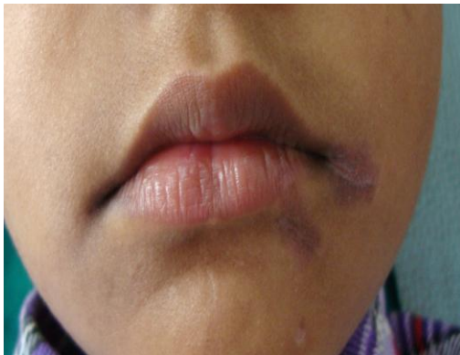
Fig 3- After 1 week healing noted with scarring.

importance of history, clinical features, differential diagnosis, investigations and management of such lesions