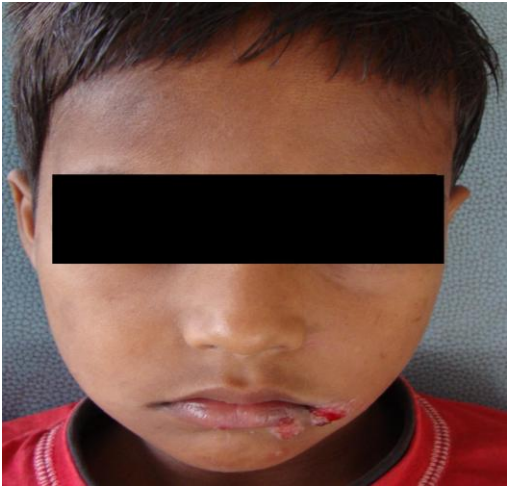
Fig 1-Child patient with lesions in the perioral region.

As the lesions mainly occur in the perioral region, patients may report to dental practitioners for opinion and management. Hence it becomes important for dentists to know the characteristics of these lesions and differentiate them from other similarly appearing lesions. Here we present a case of contact dermatitis to mango sap, along with review of literature, highlighting the