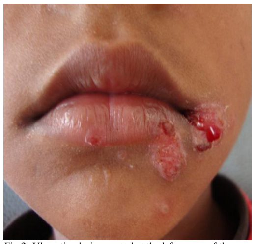
Fig 2- Ulcerative lesions noted at the left corner of the mouth and lower border of lower lip.

A five year old patient reported to the Department of Oral Medicine with ulcerative lesions at the left corner of the mouth and lower lip noticed by parents since three days (Fig1) History revealed that the child had consumed mango three days back, following which he developed tingling sensation, itching, fluid filled blisters which ultimately burst leaving painful ulcers. There was no past history of such lesions and no other skin or mucosa was involved.