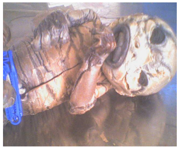
Fig-2. Harlequin baby showing cracks, and fissures of skin present all over the body along with Eclabium (fish like round mouth) and ectropion (eversion of eyelids)

1) Medical Director of Raja Rajeswari Medical College, and Hospital, Bangalore, for giving