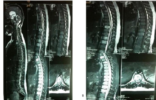
Fig 1.A and B. MRI showing features suggestive of multiple vertebral hemangiomas

extending into the epidural space compressing and displacing the cord at T1 and T2. Multiple foci of hypointensity in the lesion giving a polka dot appearance. These features were suggestive of multiple hemangioma of the thoracic and lumbar vertebra with epidural soft tissue mass at T1-T2. (Fig 1A and B)