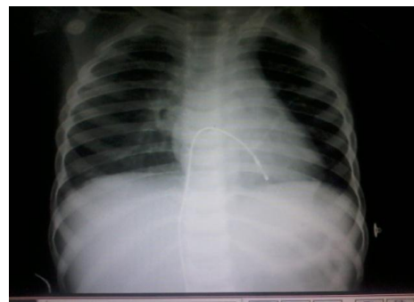
Figure 2. Chest X-ray showing pacemaker insertion.