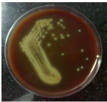
Figure 3: Blood agar plate showing α-hemolytic colonies.

Gram's stain showed numerous WBCs and numerous Gram positive lanceolate shaped diplococci morphologically resembling Strep. pneumoniae. [Figure 2]