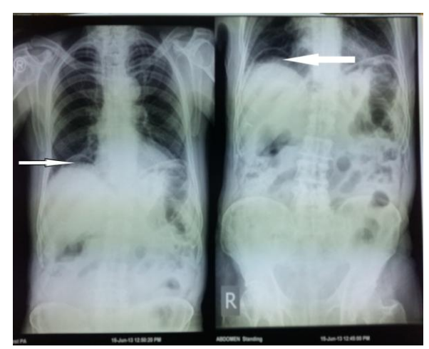
Fig.1 Preoperative X-ray showing gas under diaphragm.

77 year male presented with pain in abdomen for 3-4 days with no previous history of similar complains. He presented in casualty with acute abdominal pain and discomfort. His vital were stable on presentation but deteriorated rapidly soon after the admission in the hospital. Plain xshowed under diaphragm. gas (fig.1)Laboratory investigations were within normal limits. He was managed in intensive care unit for initial resuscitation and stabilization. Subsequently he underwent emergency laparotomy for hollow viscous perforation. Intraoperative findings were multiple jejunal diverticulae with perforation proximal diverticuli of with other diverticulae were inflamed and showing signs of impending perforation. (fig.2)