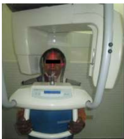
Figure.2: PATIENT POSITIONED IN PANORAMIC MACHINE

later on subjected to metric analysis in vertical dimensions for each sphere using Trophy Dicom Imaging Software. For measurement in vertical directions, most prominent points in the vertical planes were marked and the diameters of the reference spheres were measured. (fig.3)