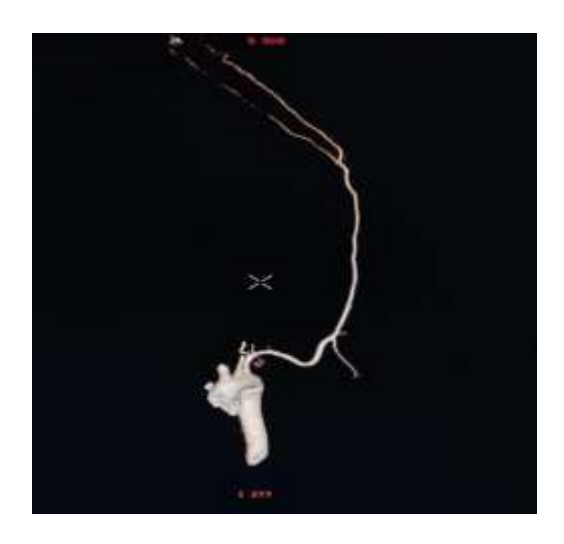
Fig 2: CT angiogram demonstrating left subclavian vein thrombosis.