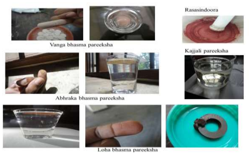
Figure 5: Ayurvedic bhasma pareeksha

Other than the above, Vanadium and Barium is seen in EDXRF qualitative data of Tarakeswara Rasa but absent in XRF quantitative concentration. Without knowing its quantity, one cannot predict whether it is a major constituent of any one of the bhasmas or adulterant or from the utensils used or from the Dravadravyas used during shodana marana procedures. Although studies<sup>21</sup> are seen on presence of nickel and chromium leeching into food during preparation in stainless steel vessels, it can only be assumed and cannot be fully substantiated at this level that they leeched out into bhasmas during drug processing. Longer duration of exposure to high heat and repeated cycles reduce Ni and Cr leeching but doesn't eliminate them entirely.