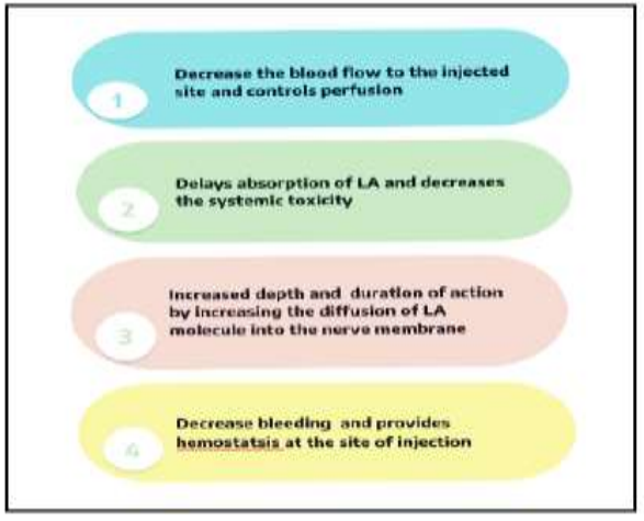
FIGURE 3 - ROLE OF VASOCONSTRICTOR IN LA [1,3]

added to a local anaesthetic is mentioned in Figure 3. The vasoconstrictors fall under 2 major categories: The catecholamines such Epinephrine, Nor-epinephrine, as Dopamine Levonordefrin, Isoproterenol, Non-catecholamines the like and Amphetamine, Methamphetamine, Hydroxy amphetamine, Ephedrine, Phenylephrine, Metaraminol, Mephentermine. The two vasoconstrictors commonly used are Epinephrine and Levonordefrin. Epinephrine remains the most effective and most used vasoconstrictor in medicine and dentistry. They are available in various concentrations like 1:1.00.000 and concentrations. Even 1:2,00,000 slight concentrations of epinephrine increase the stimulation. cardiac and is thus contraindicated patients with in hyperthyroidism and underlying cardiac disease. Levonordefrin produces peripheral vasoconstriction similar to norepinephrine and is thus not widely used in LA. Felypressin, a synthetic analogue of antidiuretic hormone is also used as a vasoconstrictor in local anaesthetics. The maximum dosage of local anaesthetics with and without vasoconstrictors is mentioned in Figure 4 .