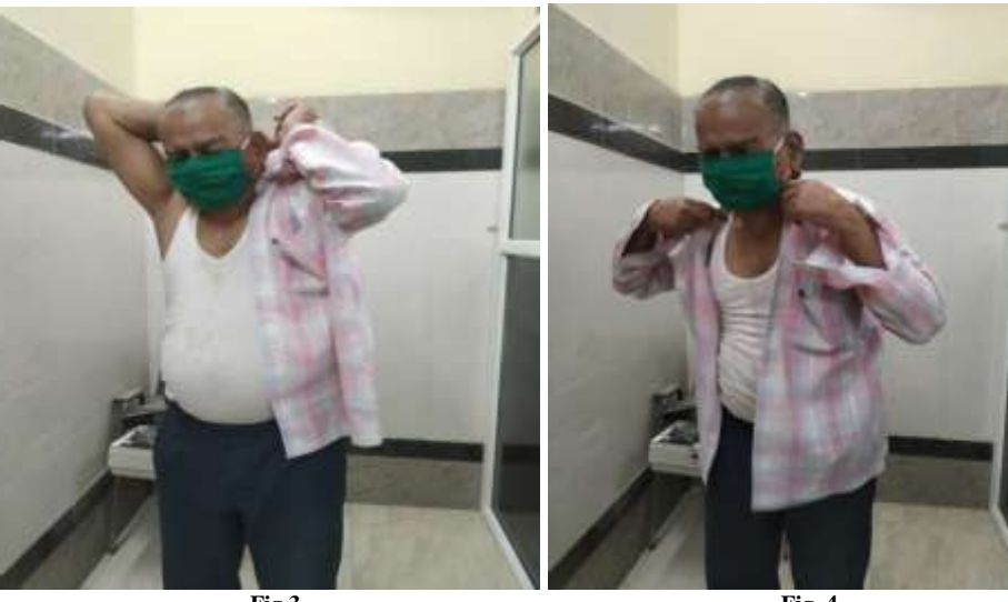
Fig 3 and 4: Actual ADL training (donning and doffing of Shirt)